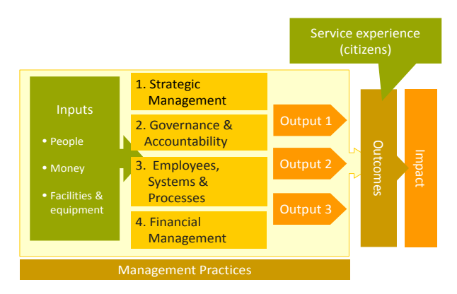
Figure 3: MPAT Model (The Presidency 2012), p.13)

Figure 2 shows the process of a department according to the MPAT model. The department supplies with public services, the resources mentioned (second column) serve to implement activities, the outputs (third column) serve to achieve the outcomes, the outcomes (fourth column) affect the lives of citizens.