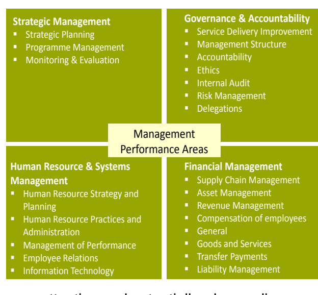
Figure 2: Management Performance Areas (The Presidency 2012), p. 12

The MPAT is an instrument to measure standards of good management practice. It is a self-assessment tool that measures quality of departmental performance. Existing monitoring and auditing results are taken into account for the assessment of the management practice as secondary data. MPAT focuses on for management Key Performance Areas (KPAs):